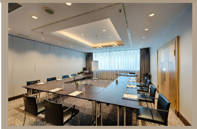
Meeting room - 2nd floor (43 m 2 )