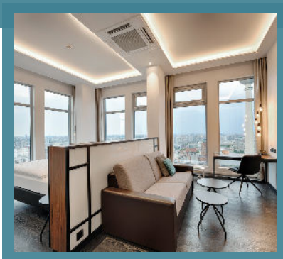
Sky Suite Corner (47 m 2 )