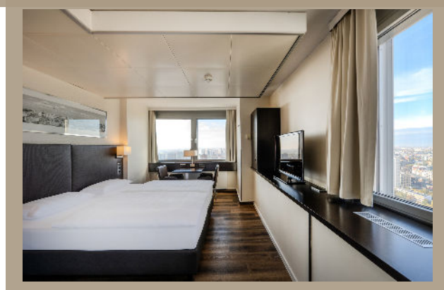
Standard panorama room City View, (24 m 2 )