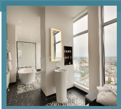
Sky Suite Corner Deluxe (57 m 2 )