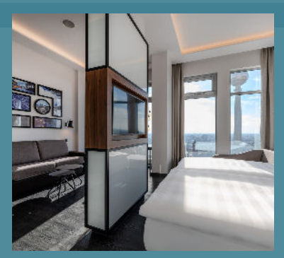
Sky Suite (42 m 2 )

16 luxurious suites for an exceptional stay on the 37th floor.