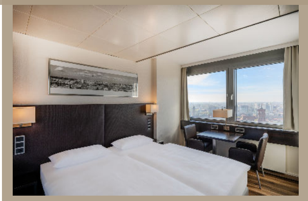
Standard double room City View, (19 m 2 )