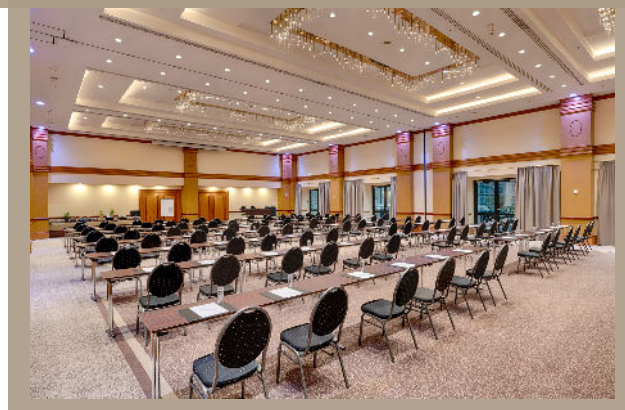
Salon Döblin - 3rd floor (350 m 2 )